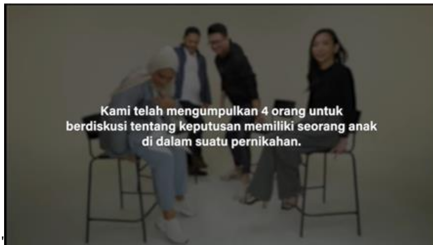
Figure 2. Content 'Sudut Pandang' Episode 8's

that are packaged in a fresh and contemporary way and do not invite sensitivity in its content so that it attracts a lot of audience attention, especially among young people (Kurniasih & Hastjarjo, 2023). One of the contents published by Cretivox is episode 8's "Point of View" segment entitled 'Mending Punya Anak atau Ga Punya Anak' [Better to have children or not].